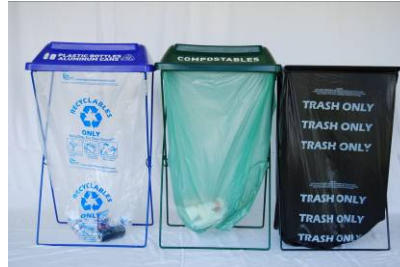
Example: Eco-station using ClearStream™ containers.